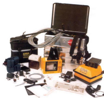
Ground Penetrating Radar Accessories