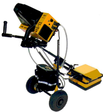
Ground Penetrating Radar